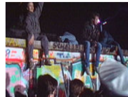
NBC's Tom Brokaw Recalls the Night the Berlin Wall Fell