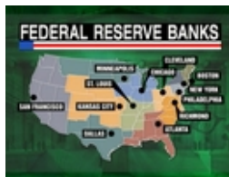
Today's 101: The Federal Reserve and Treasury Department