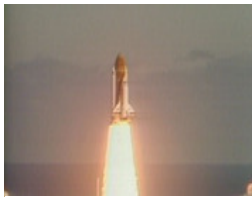
Space Shuttle Challenger Explodes After Liftoff

By tying course content to real world events, students are given an intimate look at why the concepts they are learning are relevant beyond the college classroom. The interdisciplinary nature of the news allows students to see the broad impact it has on their lives.