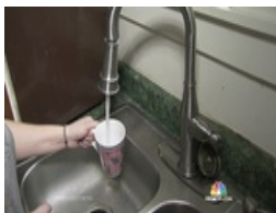
Lead Levels in Water Cause Health Emergency in Flint

Professors can use NBC News stories to enhance and provoke discussion, compare/contrast ideas, or to support or summarize the content of their lecture. The majority of the NBC Learn videos average between 2-6 minutes in length, which provides versatility within the course.