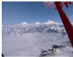
Mount McKinley Renamed Denali