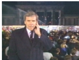
East German Government Allows Travel Between East and West Berlin