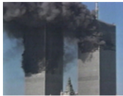
September 11, 2001: Timeline of Events