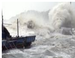
When Nature Strikes: Hurricanes