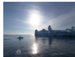
Never Before Seen Changes in Greenland's Iceberg Alley