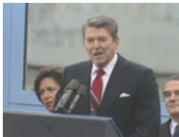
President Reagan Delivers Speech at Brandenburg Gate

For decades, NBC News has covered every major news event around the world. These stories often evolve over time, giving NBC Learn the power to put history into context for students. For stories that pre-date video or aren't covered by our archives, NBC Learn has produced hundreds of short mini-documentaries, exposing students to historical narratives that still permeate their lives today.