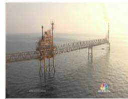
Global Impact of a Sanctions-Free Iranian Economy