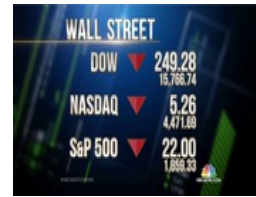
Stocks Plunge Before Partial Rebound on Roller Coaster Day